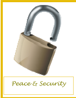
Peace & Security

Financial Peace University seeks to see families in every community working together, helping one another walk daily with peace: with both the peace and security that come from having one's personal finances in control and, more importantly, the peace that comes from knowing and trusting in Christ Jesus. During this 13 week, Biblically-based, life changing outreach you will learn how to remove the stress that comes with financial problems and change your financial future.